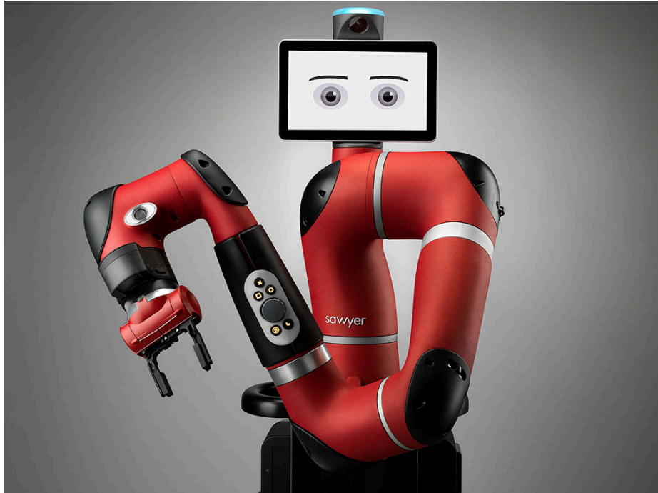
Roomba, iRobot; Sawyer, Rethink Robotics