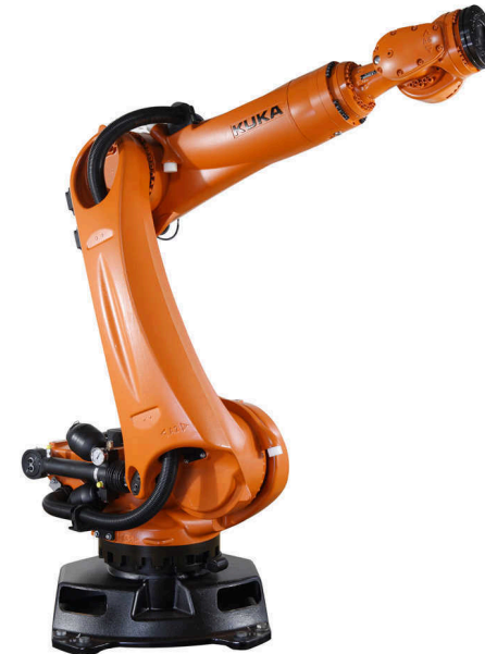
Talos, MIT; Kuka manipulator